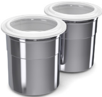
2 Chrome steel cups with sealing cap