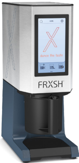
FRXSH Mousse Chef with protective beaker